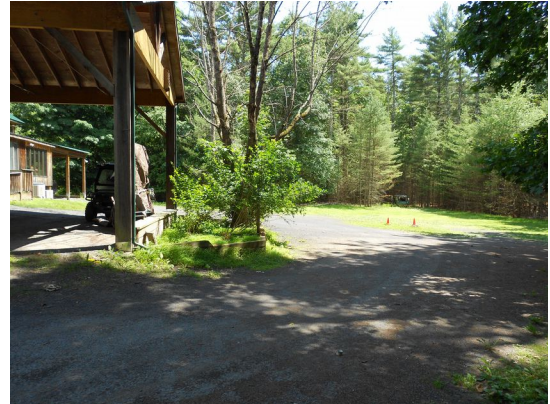
staff / musician parking

Bus parking is on the LEFT in both pictures