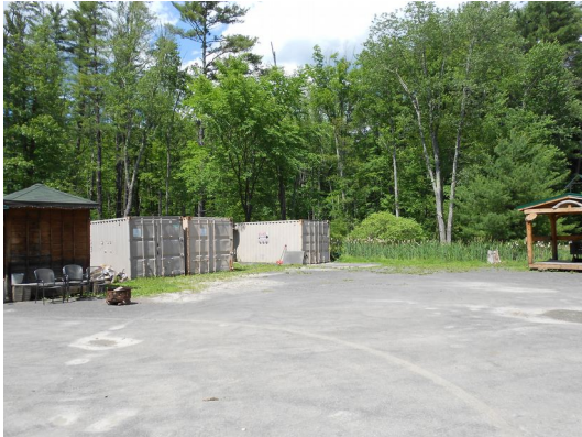
limited staff parking area ticket booth on left